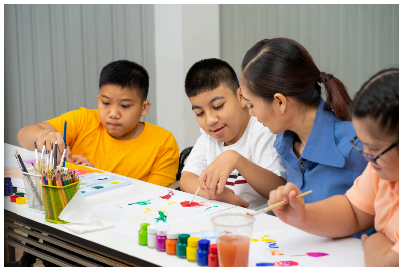
Asian disabled boys and autistic girl learning to color/paint in school