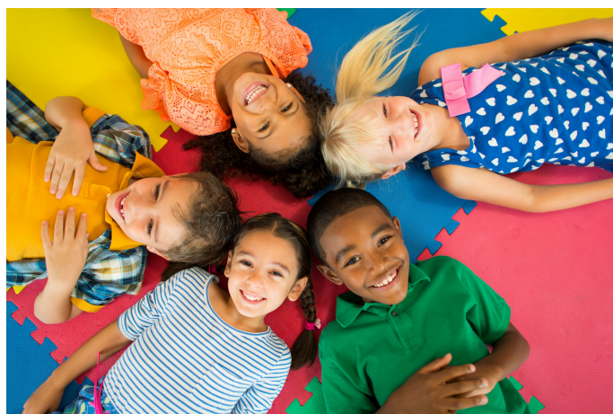
Diverse group of children laying down looking up at the camera