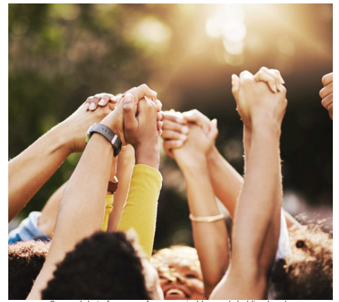
Cropped shot of a group of unrecognizable people holding hands